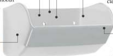
CLASSIC STYLE CC-HD Impact-Modified Nylon Elevator Bucket

Highest grade of prime virgin resins for unequalled impact strength and superior abrasion resistance.