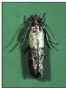
Indian meal moth.

sure to carbon dioxide also makes the females lay eggs.