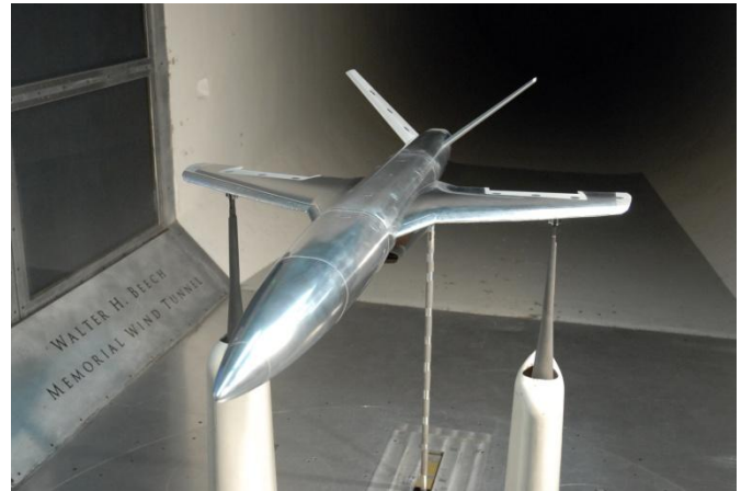
CEi's Firejet-II at the WBWT

The WBWT, a low-subsonic (up to 240 mph) closed-return wind tunnel with a 7x10-foot test section, is well-suited to the size range desired for UAS scale models. Test capabilities include continuous full-day runs of powered models, high angles of attack (up to +50°), advanced on-board instrumentation (pressure measurement, accelerometers, control surface loads, etc.), and real-time data processing and support. Model mounting options include sting support strut/internal balance and variable strut/external balance methods. Complete mount hardware image systems are available for all common test mounting setups.