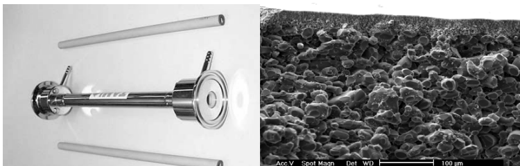
Fig.1: Module and ceramic membranes (SEM-micrograph) used.

1 as indicated by the manufacturer; 2 average pore size