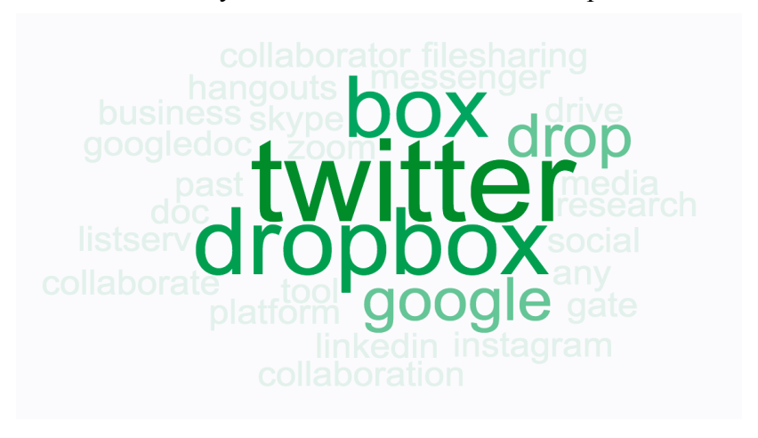
Figure 2: Other social media platforms used for professional networking and collaboration purposes

for professional networking and collaboration purposes. A word cloud analysis was conducted on their responses. Font size correlates with the frequency that certain social media platforms were mentioned by the survey respondents. Error! Reference source not found. indicates that Twitter and Dropbox are also professional networking and collaboration social media venues that many survey respondents have on their