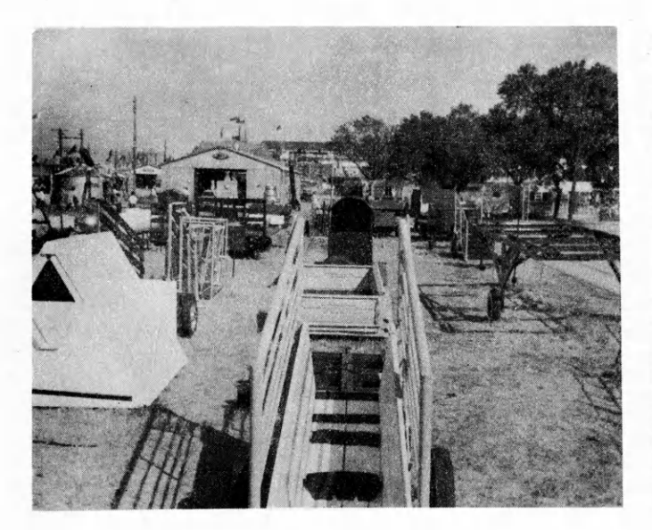
Farm Mechanics exhibit shown at the Kansas State Fair, Hutchinson, by members of the Kansas Association of Future Farmers of America.