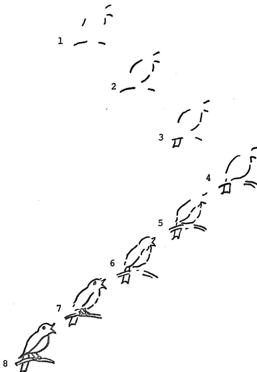
Fig. 1. An example of a perceptual inference sequence.*