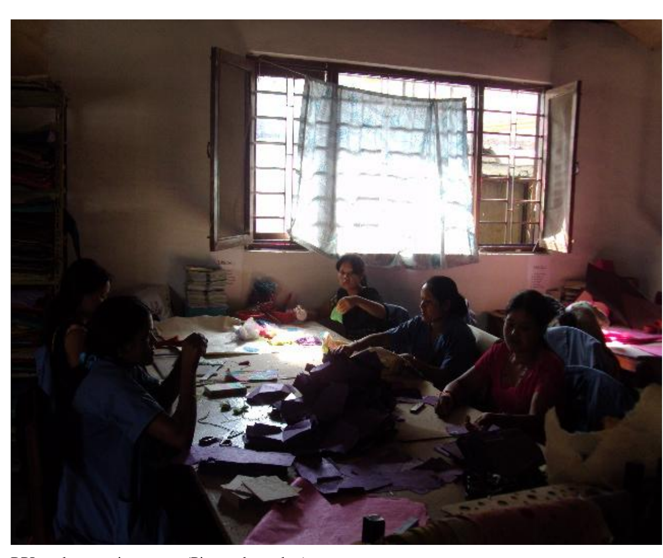
BPI workers pasting papers