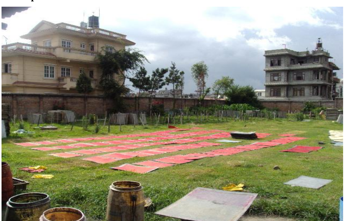
Figure 2.1: Paper Producers at Work

During my visits, workers in BCP, BPI, and GPI were engaged in different activities of paper production: product designing, paper cutting by hand and machine, paper pasting, print works, dyeing papers by soaking them into the mix of water and dyes, drying papers on screen, packing the finished products, carrying the packed boxes for storage, and some other work. Some workers were involved in the recycling unit of the company to produce handmade paper by using paper wastes. With some exceptions – of machine work, drying paper, and carrying boxes – most of the work in the paper companies is sedentary. Most of the workers reported that their job was "easy" and this might be true in the sense that a large majority of workers in each company had started the work without previous job experience and formal training. Furthermore, they had mainly learnt their work by simply watching others for a couple of days.