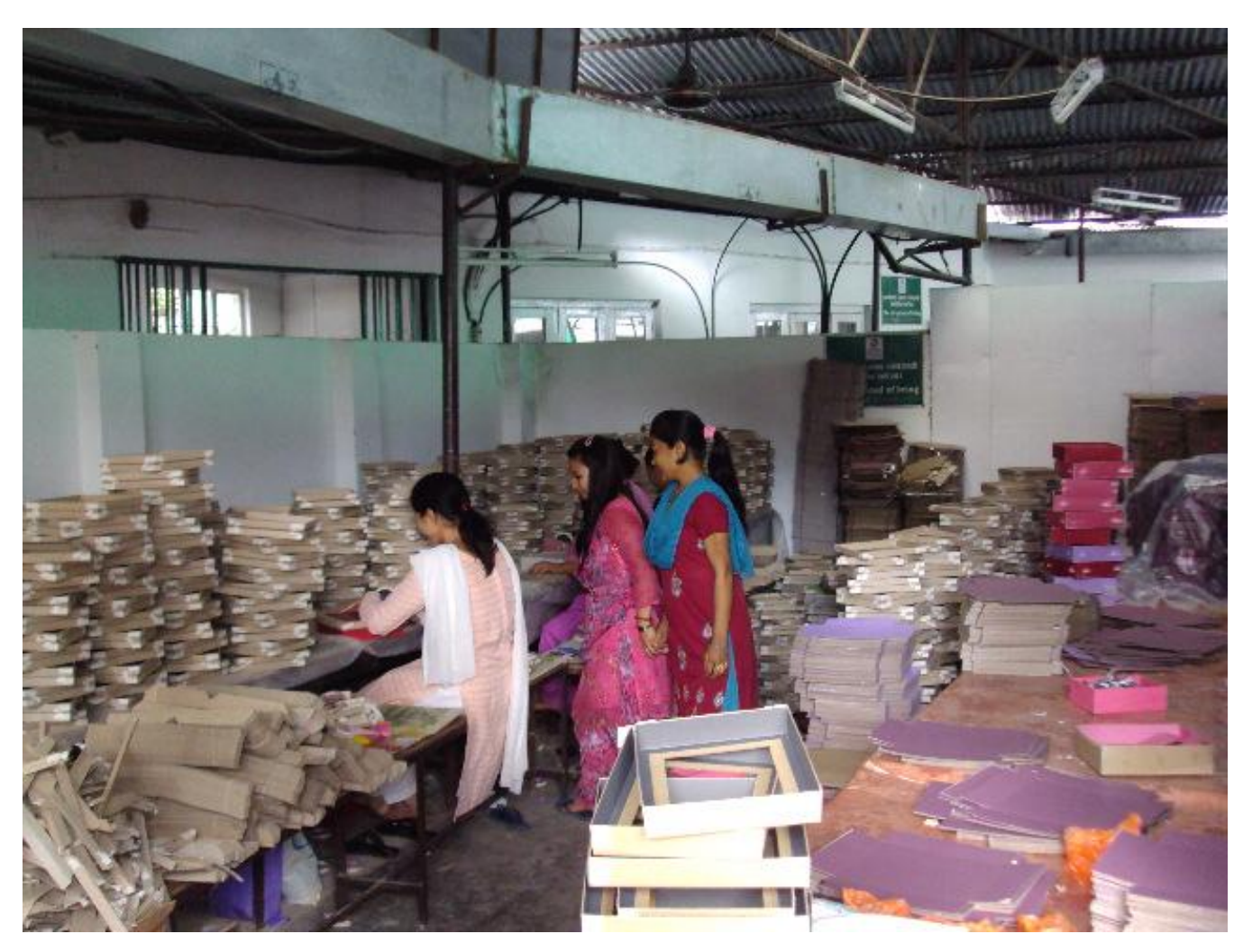
GPI workers making paper boxes