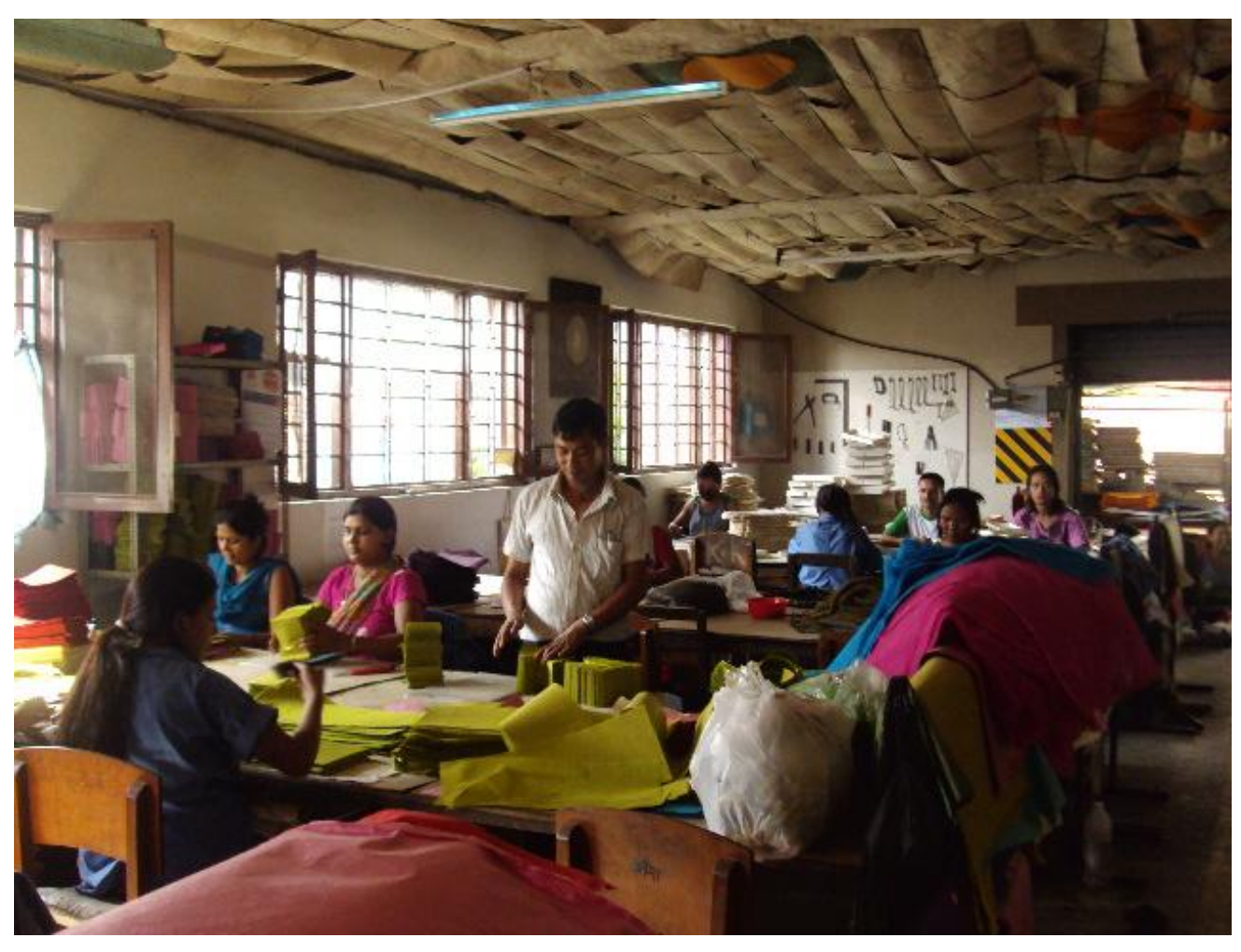
BPI workers cutting papers