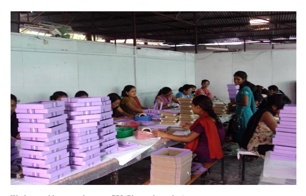
Workers making paper boxes at GPI