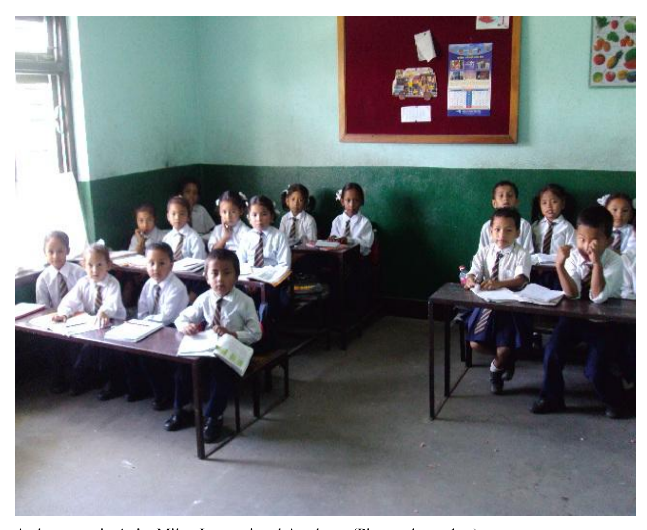
A classroom in Anita Milan International Academy