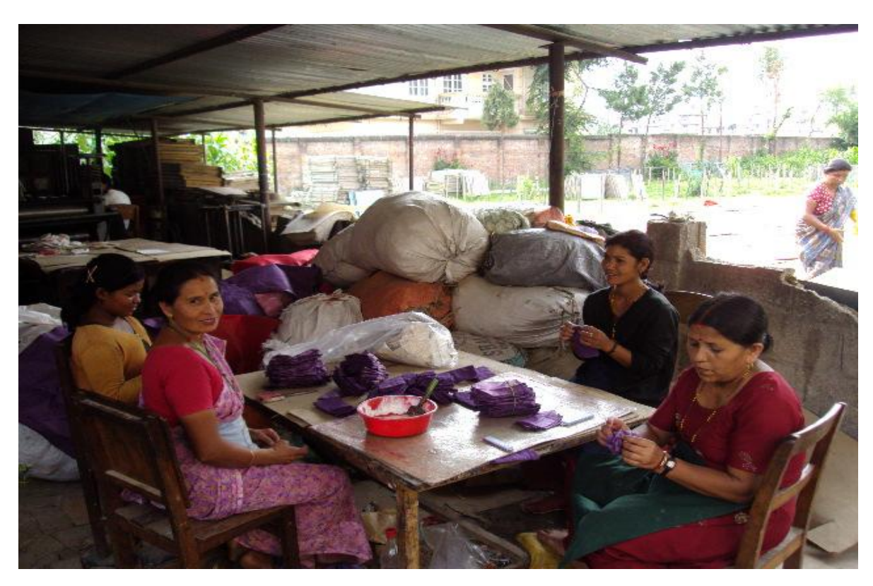
Workers pasting papers at BPI