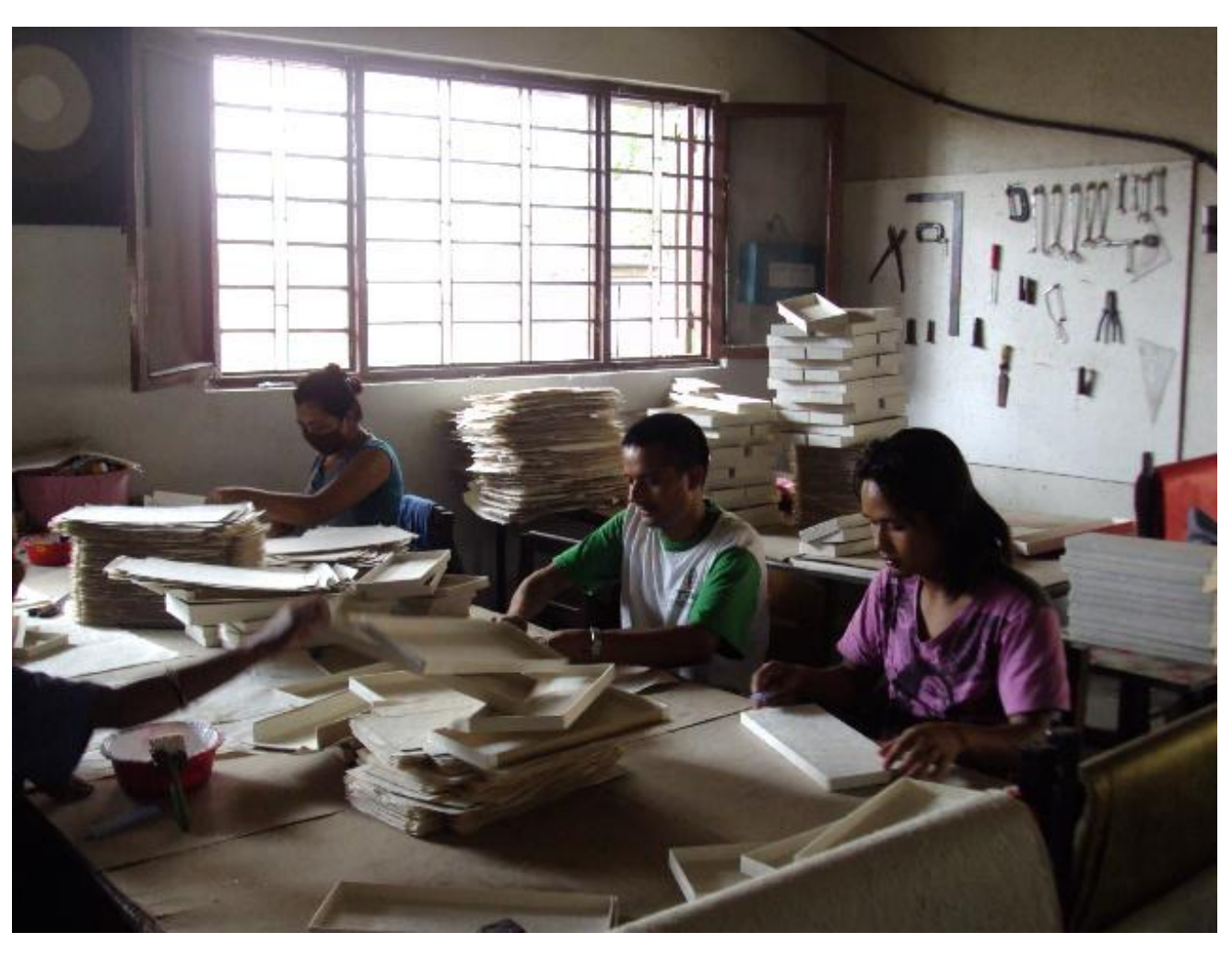
BPI workers cutting and pasting papers