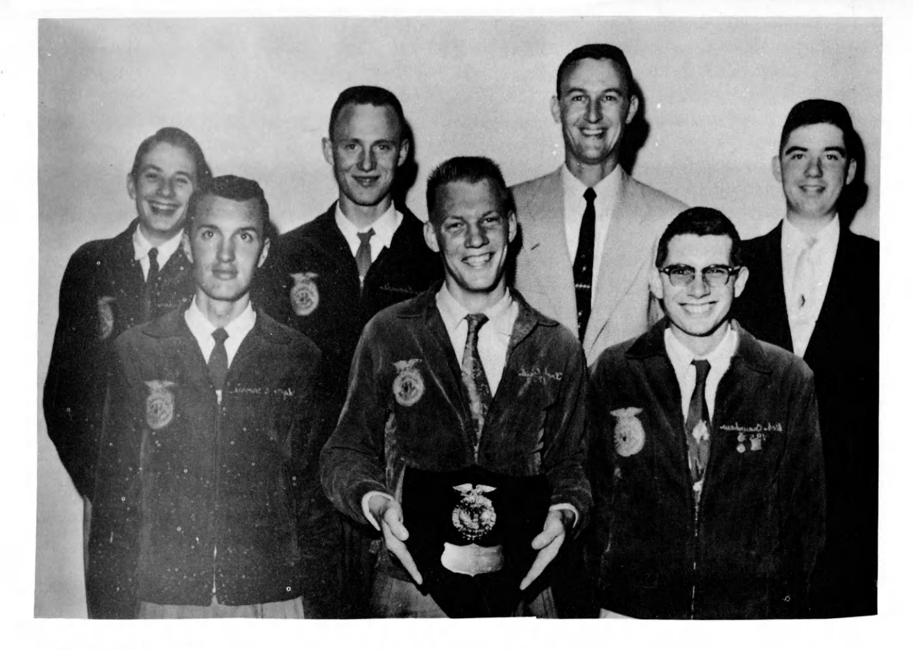
Fredonia Chapter, winner of the Agricultural Education Club Plaque, received the highest total score in all activities open to FFA members.